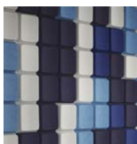
SOUNDWAVE® PIX Acoustic Panel By Jean-Marie Massaud