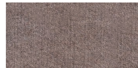
DARK BROWN 7578