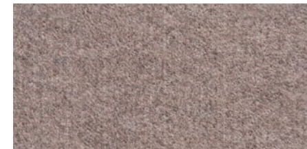
MEDIUM BROWN 7577