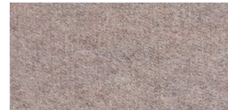
LIGHT BROWN 7576