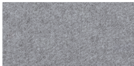
MIDDLE GREY 7597