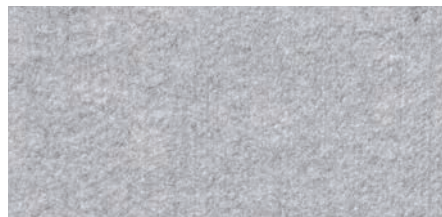
LIGHT GREY 7596